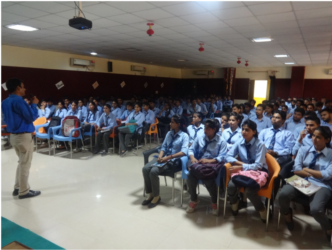
President of Jilaadhikari Foundation delivering lecture on importance of Rain Water Harvesting